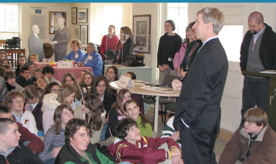
New Hampshire Governor John H. Lynch addresses students prior to the start of the 4 Reality™ Financial Education Fair sponsored by Service Credit Union.