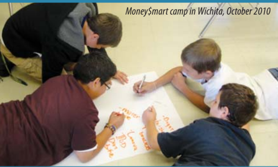
MoneySmart camp in Wichita, October 2010