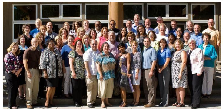
This DE graduation group picture reminds us of the pride we shared when receiving our certification.

Regardless of where else you may have graduated from or the certifications you may have earned, few of us carry in our hearts a place any abbreviation we are prouder to have after our names than "CUDE." Help ensure our CUDE certification will continue to have meaning for us and be available to the next generation of professionals.